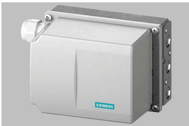
SIPART PS100 in aluminum enclosure

The SIPART PS100 electropneumatic positioner is used to control the process valve or damper position of pneumatic linear or part-turn actuators. The SIPART PS100 regulates the process valve according to the setpoint.