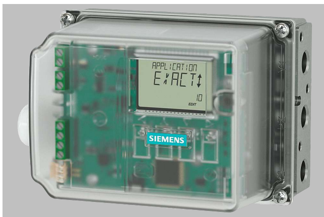
SIPART PS100 with polycarbonate lid