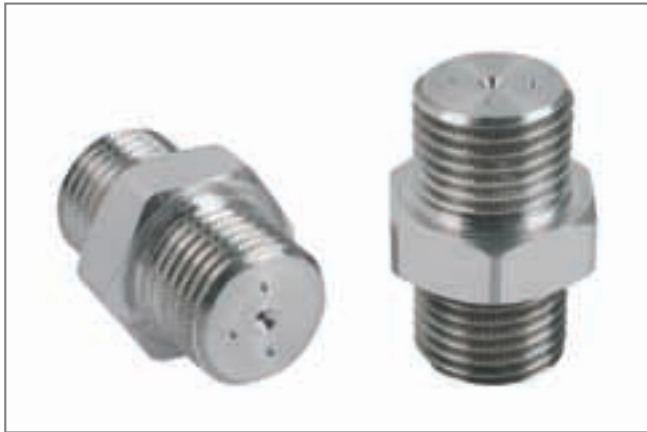
Flow resistors SW